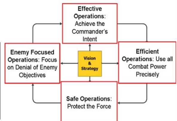
Combat Analytics Balanced Scorecard